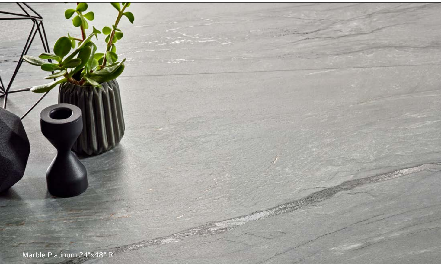
Marble Platinum 24"x48" R