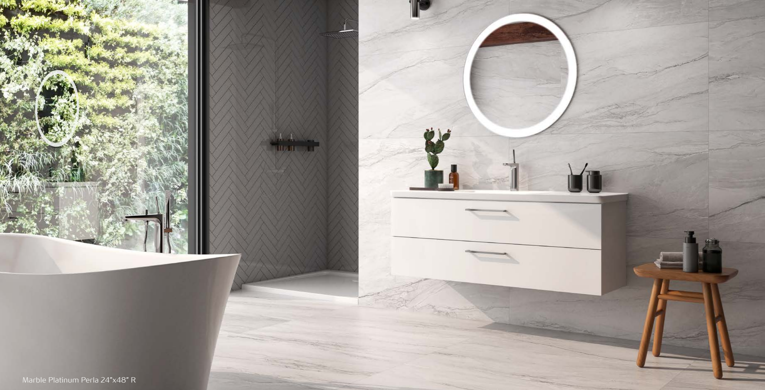
Marble Platinum Perla 24"x48" R