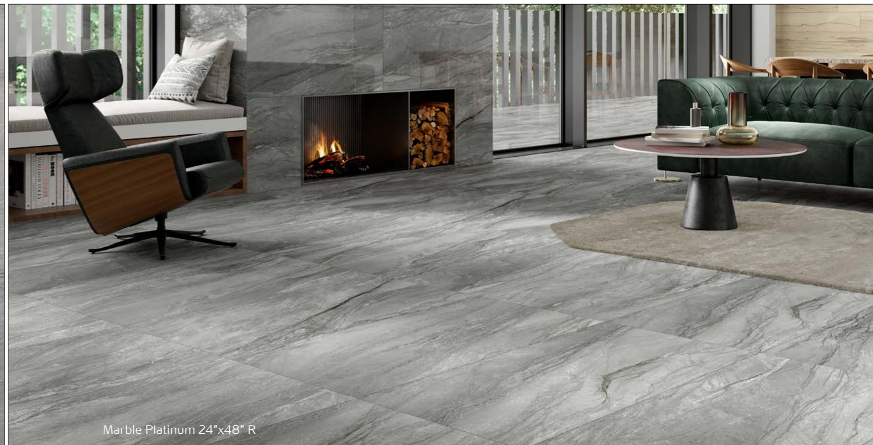
Marble Platinum 24"x48" R